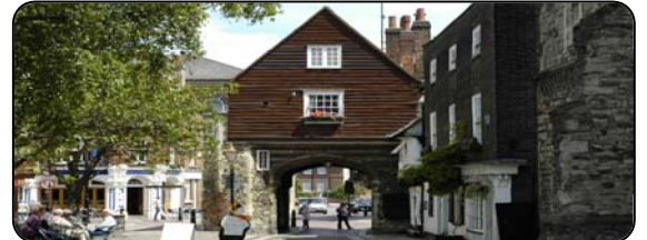
Dickens had many connections to Rochester, Kent.

There are many activities happening to mark this special Bicentennial. Have a look at www.dickens2012.org for more information!